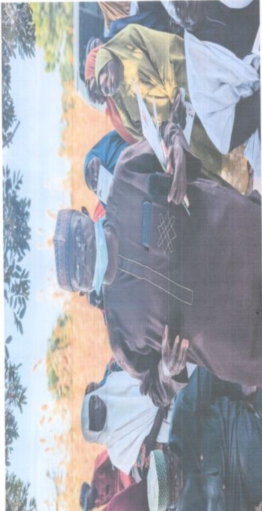
District Head of Yankau delivers his remarks