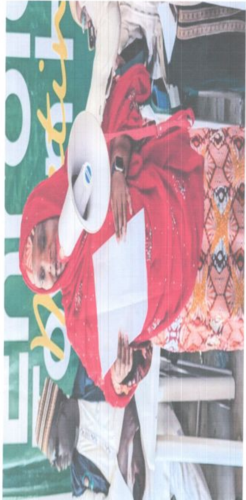
the ES delivering her Opening remarks