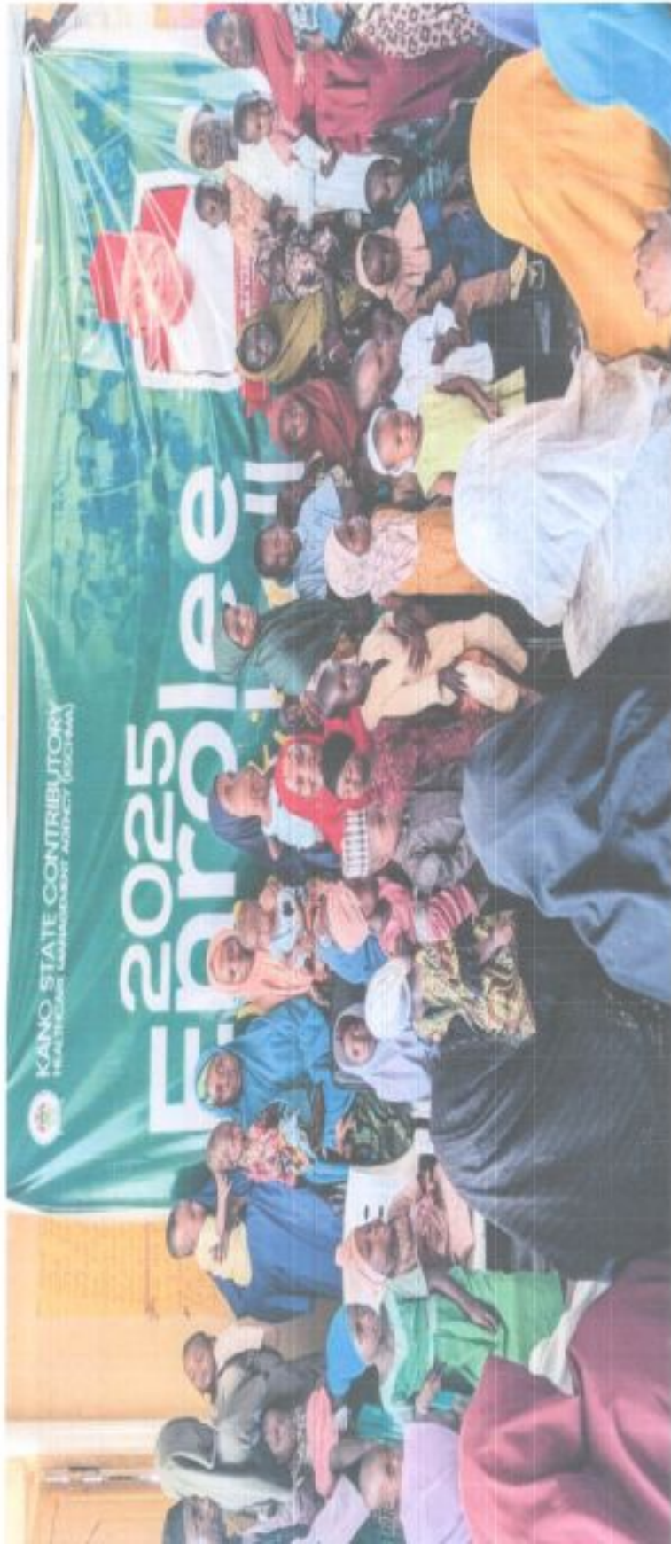
The ES KSCCHMA with children born under the BHCPF program at U/Uku PHC Town Hall Meeting